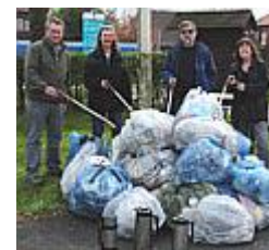
Even Woodford needs tidying!