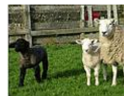
Lambs of all hues enjoying the sun!

Selected photographs will be added to the community website. Existing photos may be seen here